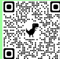
A Superhero Like You