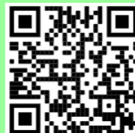
The Three Little Pigs