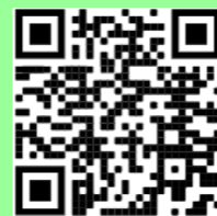
Little Red Riding Hood